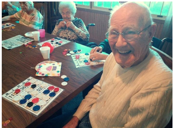
RESIDENTS ENJOY BINGO AT HILLTOP OF PEPPER BIRTHDAY PARTY.