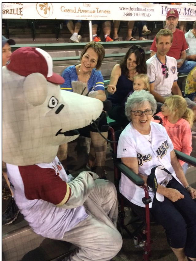
Hilltop Grand Village members and staff attended a Rafter's baseball game. Mascot Rosco P. Rafter gives high-fives and poses in the stands with fans. Former Brewers pitcher Rollie Fingers was the guest that night, so Rosco is sporting a 'stache in honor of Rollie's famous handle-bar mustache..