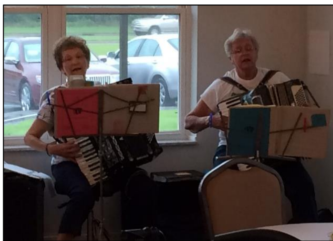
The Honey Bees accordion ladies, entertain at Hilltop Grand Village. Visitors, guests and members enjoyed the old-time music in the Dining Room.